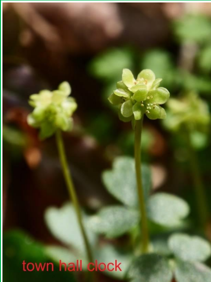
town hall clock